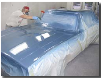
Sean Callahan from Showcase applying the first of the car's 2-tone colors "Glacier Blue"