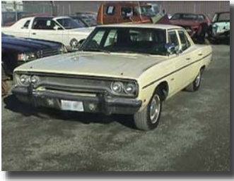
Vehicle #521 as it looked in 1999